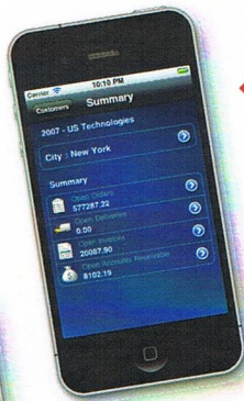
◀ Customer summary screen