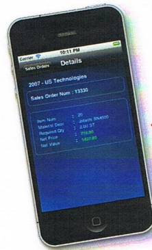
◀ Customer sales order detail

COMING SOON! New mobile apps from MyTecSoft : my WORK my NAVI my CONSIGN my QUOTE my MATMOVE my SUBCON