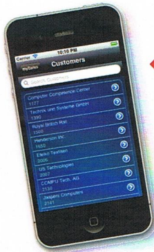
◀ Quick reference list of all your customers