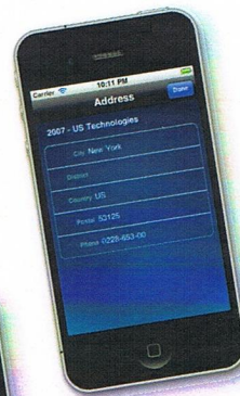
◀ Customer address and contact info screen