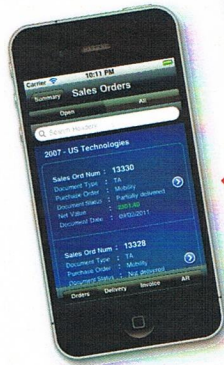
◀ Sales order info